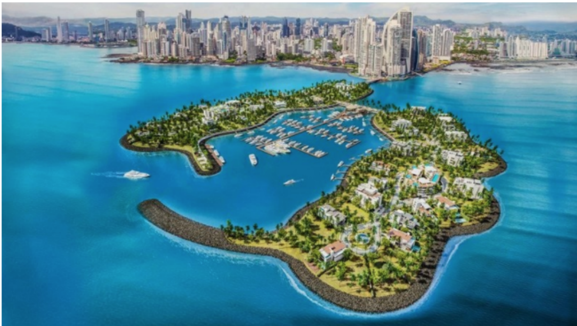
Ocean Reef Islands Panama; images: oceanreefislands

A private residential community is raised from the seas in Panama – the Dubai of the Central America. The man-made islands off the coast of Panama are named Ocean Reef Islands and are conceived by real estate developer Grupo Los Pueblos. An ambitious development such as Ocean Reef Islands demanded world class exceptional planning and engineering ingenuity. Numerous advisors were contracted to guarantee state of the art engineering. The islands design responds to the requirements of prestigious professional coastal engineering and environmental firms such as URS and Delft Hydraulics. These firms provided the guidelines for the location and forms of the islands in order to produce a rare combination of engineering and ecological beauty.