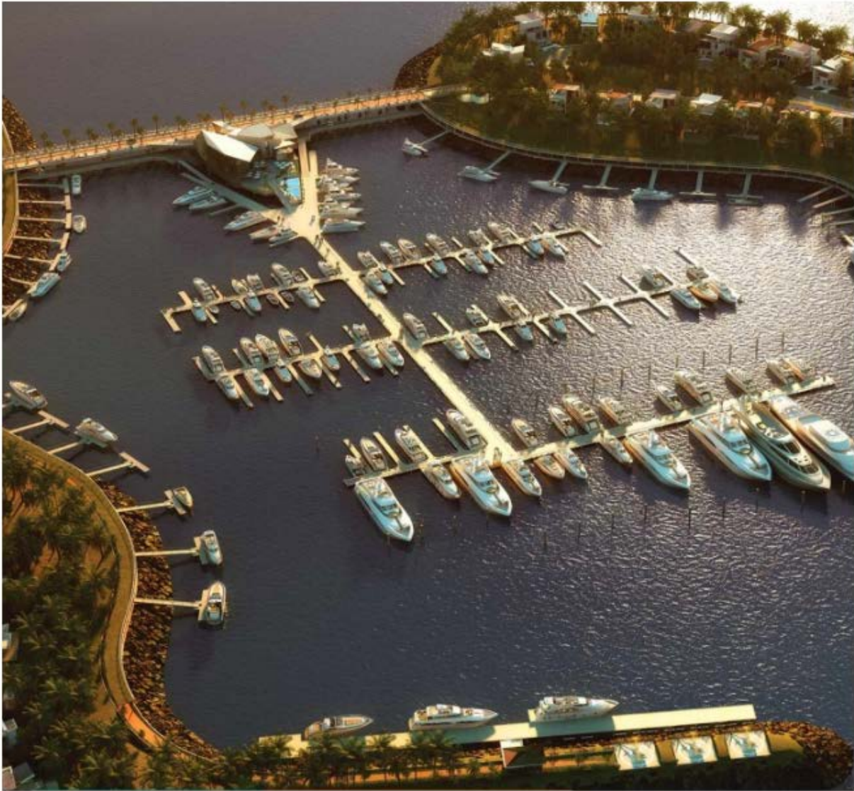
Ocean Reef Islands Panama; images: oceanreefislands